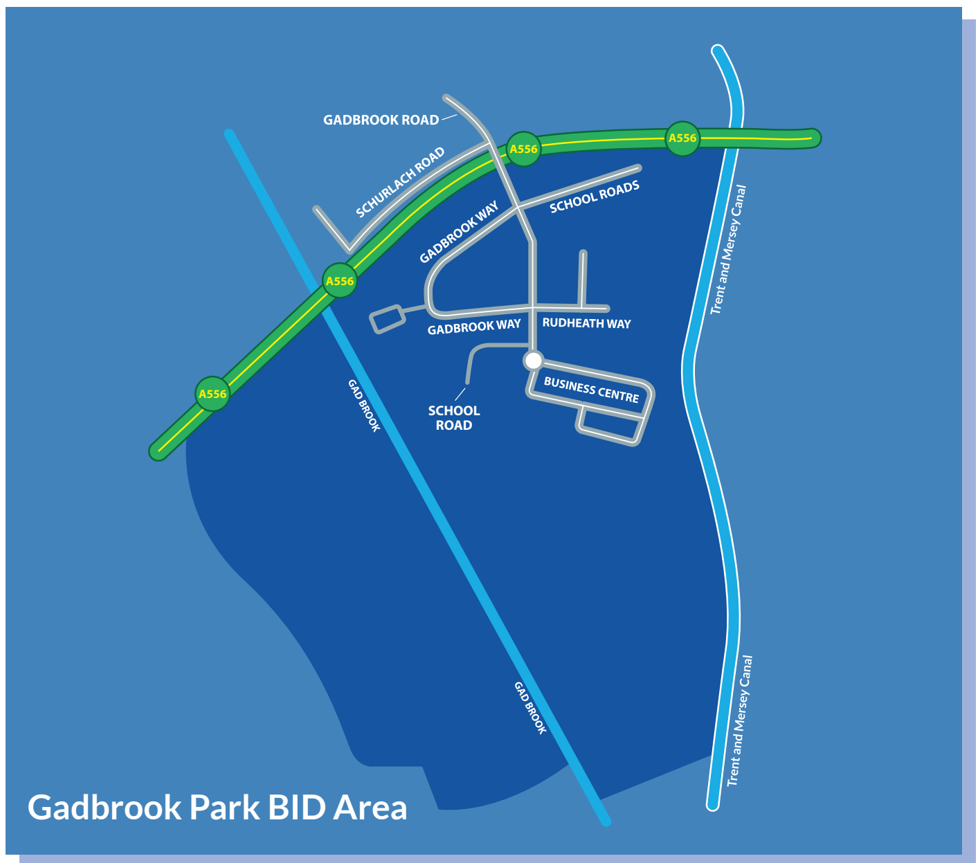
Gadbrook Park BID Area